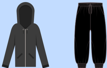
Black Zip jacket and Black Joggers

Items with Logos or Leggings are not permitted