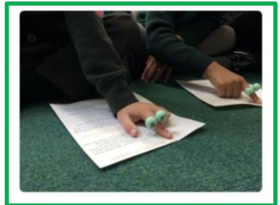
An extra pair of eyes so we don't miss a word!