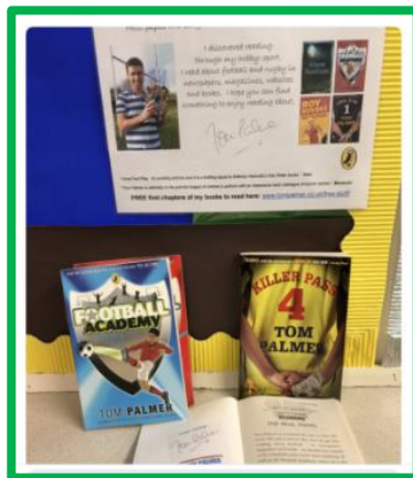
Class Authors we write to and they write back!