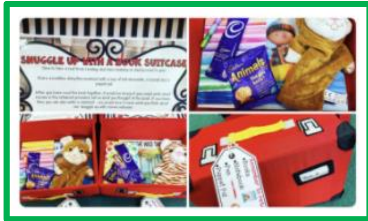
Story Suitcases are back!