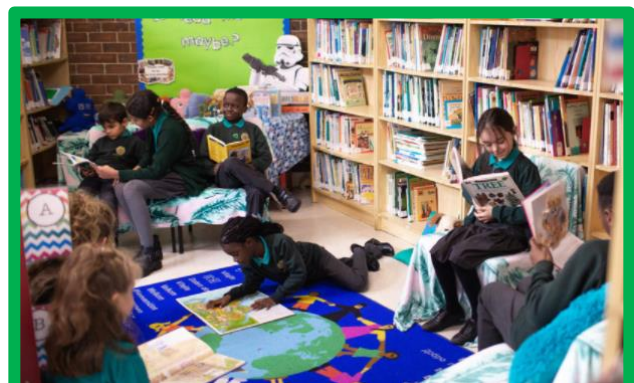
Lunchtime Library is Open, Come on In!