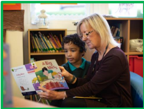
Reading with adults in school.