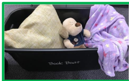
Sail Away in a Book Boat at Break